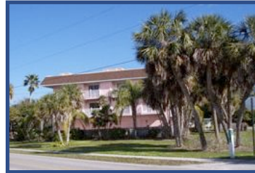
Beside Still Waters