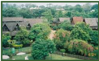
The Juniper Tree