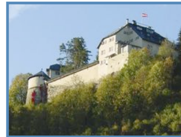
Schloss Mittersill, Austria

Le Reposoir in Northern Brittany, France offers missionaries a place to reflect and be restored, to rest and enjoy God's intimacy in the beauty of silence. "We are a tranquil place in the French countryside, provided especially for missionaries."