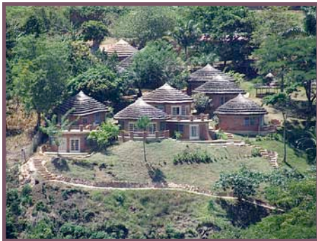
Mto Moyoni, Uganda, East Africa

Mto Moyoni is a beautiful retreat center in Njeru, Uganda . “Sit back, relax, enjoy the view over one of the worlds longest river. In the quietness of the beautifully laid out gardens just know that God is God.”