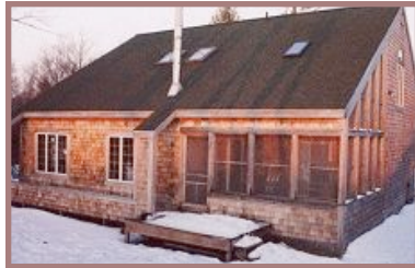
Quiet Place Ministries