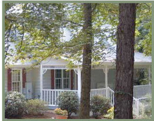
Missionary Care Ministry

"We have no programs at Beside Still Waters ; the time is yours to spend with God however you see fit." The condominiums are 40 miles from Tampa in Manatee County, Florida and about one block from the beach.